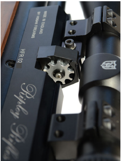
Magazine fitted to the 'Elite'