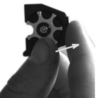
Photo 3 Indexing. Right side fitting magazine shown.