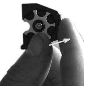
Photo 3 Indexing. Right side fitting magazine shown.